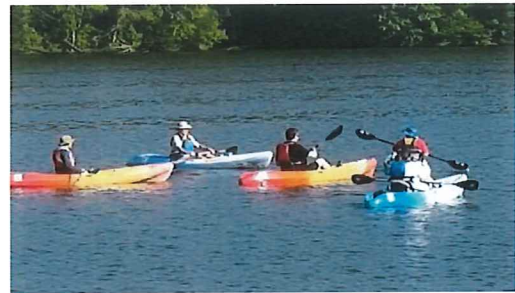
Paddle Tour starting their adventure.