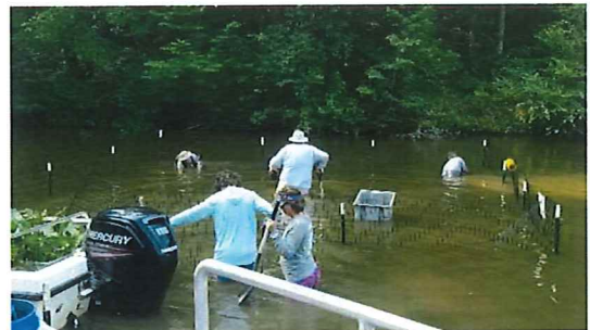
NC Wildlife and volunteers planting aquatic vegetation.