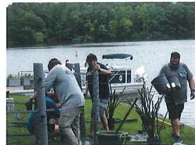
Angler work day.