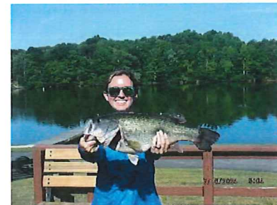
One of those nice 6 pounders.